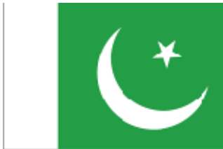
Pakistan July 6, 2011