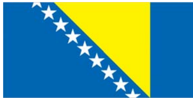
Bosnia and Herzegovina May 24, 2011