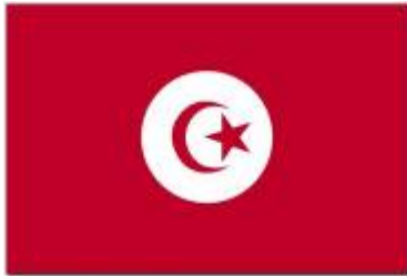
Tunisia February 1, 2012