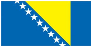
Bosnia and Herzegovina June 15, 2011