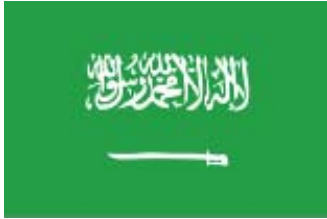
Kingdom of Saudi Arabia May 25, 2011